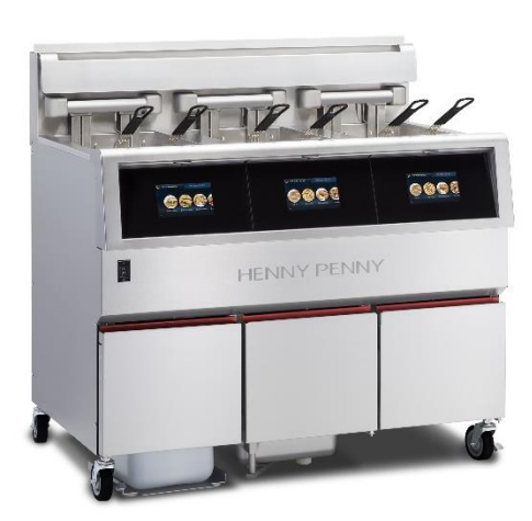
OFE 513 3-well open fryer