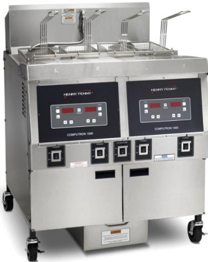
OFE 322 2-well electric open fryer with split vats and Computron™ 1000 control

OFE 321 1-well electric OFE 322 2-well electric OFE 323 3-well electric