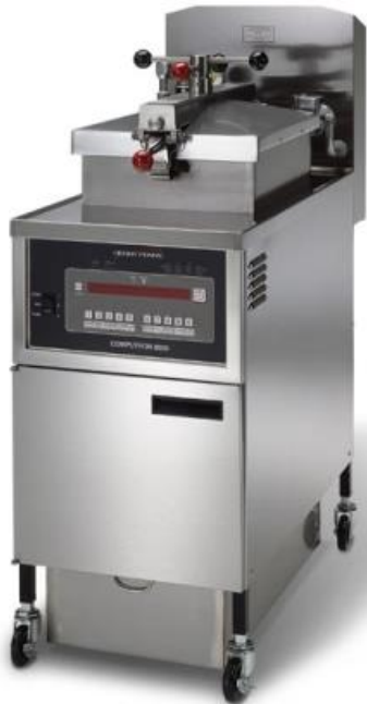
PFG 600 gas pressure fryer with Computron™ 8000 control

Henny Penny first introduced commercial pressure frying to the foodservice industry more than 50 years ago. Frying under pressure enables lower cooking temperatures for longer oil life, and faster cooking times to meet peak demand. Pressure also seals in food's natural juices and reduces the amount of oil absorbed into product.