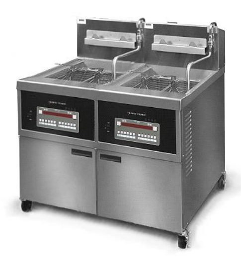
OFG 342 2-well large capacity gas open fryer with Computron™ 8000 control

Henny Penny open fryers offer high-volume frying with programmable operation, oil management functions and fast, easy filtration.