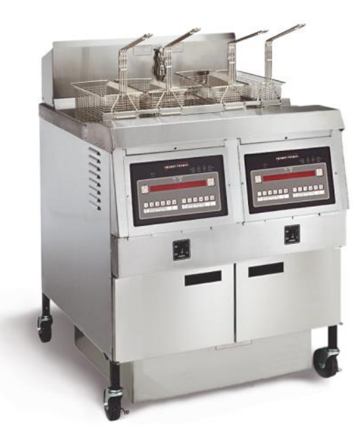
OFG 322 2-well gas open fryer with Computron™ 8000 control

Henny Penny open fryers offer high-volume, integral multi-well frying with programmable operation, oil management functions and fast, easy filtration.